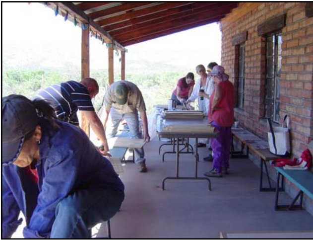
Building bat houses.