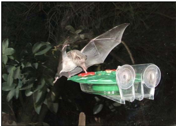
Mexican long-tongued bats ( Choeronycteris mexicana ) and Lesser long-nosed bats ( Leptonycteris curasoae ) are known to frequent hummingbird feeders in summer.

Over the next year, I will be following up with participants to see how successful the houses have been in attracting bats. I will also be collecting data on placement, direction and height as well as the color they were painted. This information may serve useful for others who want to install bat houses in this area.