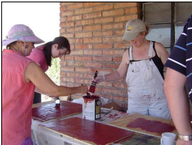
Staining the inside of the bat houses.

The Ed Center held a bat house building workshop on June 9th at the Cascabel Community Center. Twenty-three people attended and built 19 bat houses. Every bat house seems to have found a home.