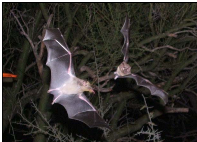
Nighttime visitors.

Redington Conservation Education Center has handouts that you can use, including a plan for the construction of a single chamber bat house and criteria for successful bat houses. We also have a Bat House Builder's Handbook and a DVD on Building Bat Homes that we will gladly loan out. These materials are from Bat Conservation International. You can contact me at 212-1441 if you would like to borrow any of these materials. You can also read about BCI's bat house program at http://batcon.org and click on Conservation Programs.