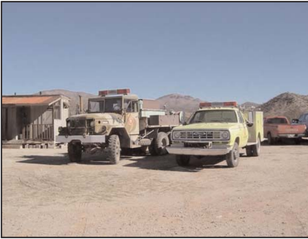
CVFD trucks on display at Gammon's Gulch for CVFD Annual Meeting in January 2008.