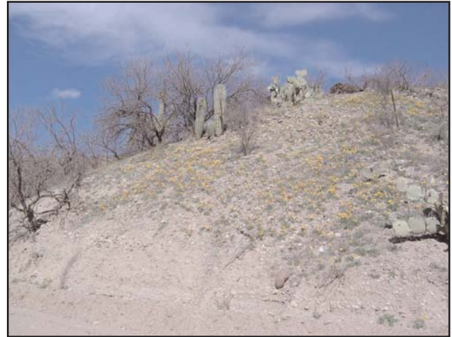
Poppies are blooming on local hillsides.